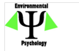
Figure 3, proposed for 2014