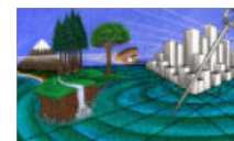
Figure 2, from 2006