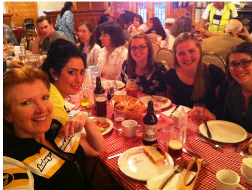
Section Members at Relais de Pins

Plus, attendees received gifts of handcrafted wooden musical spoons.